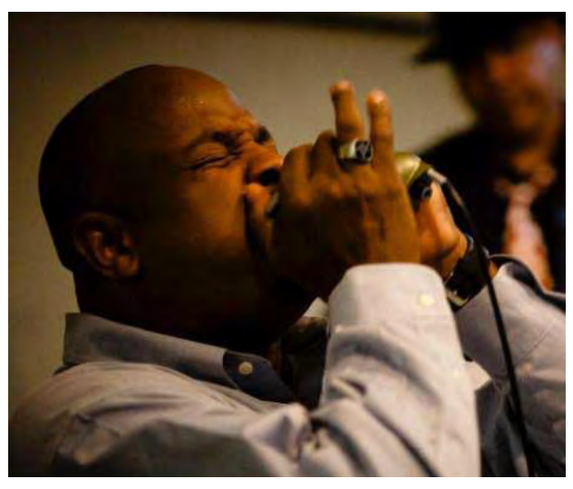
Rhythm and Blues