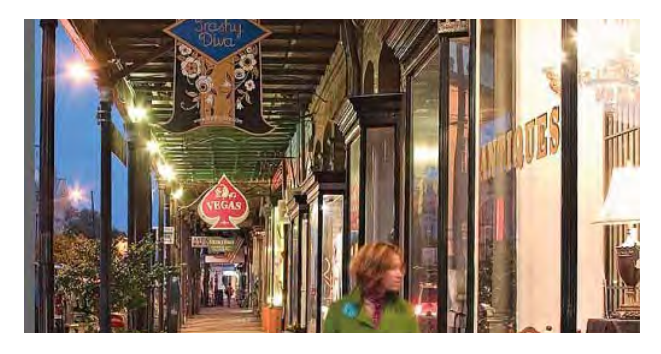
The Best New Orleans Shopping