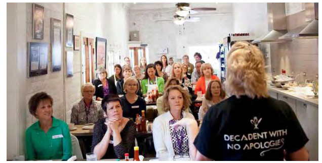
New Orleans' Culinary Culture