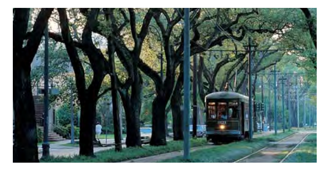
The Garden District