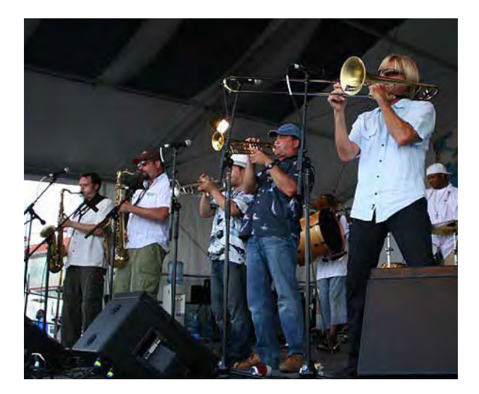
High Energy Brass