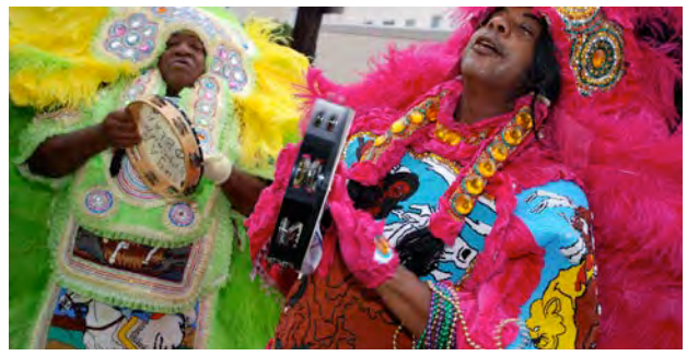
Mardi Gras Indians