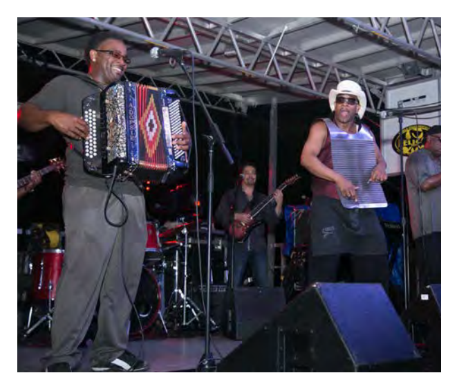
Down Home Cajun Zydeco