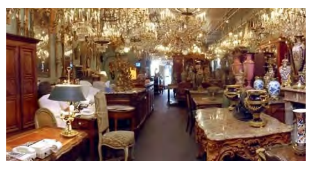
Antiquing in the French Quarter