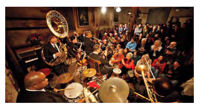
The New Orleans Sound