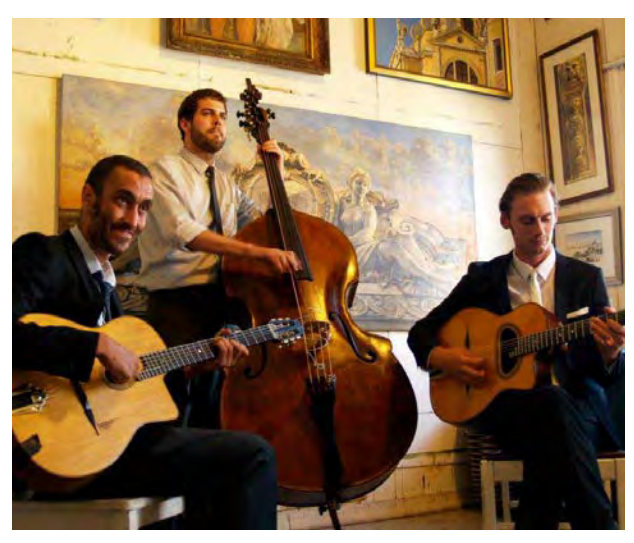
Hot Jazz Trio