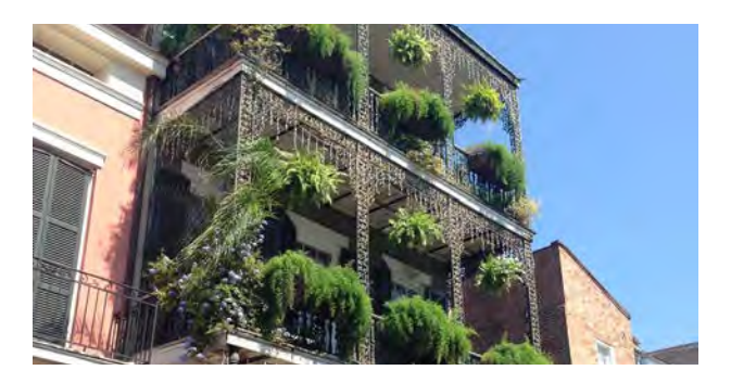
The French Quarter