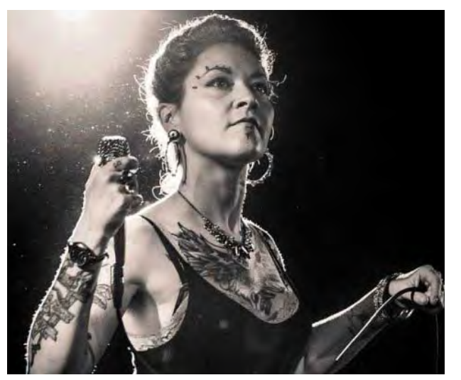
Traditional Jazz with Contemporary Edge