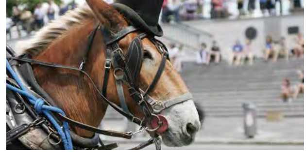
The French Quarter by Carriage