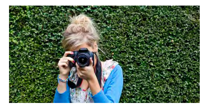
Photographing New Orleans