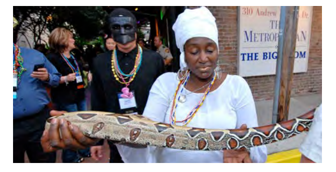
Voodoo Snake Charmer