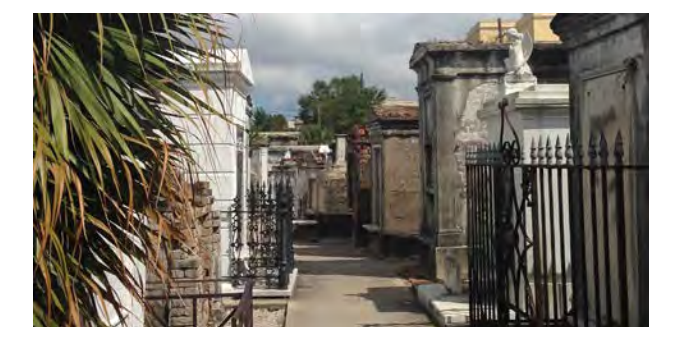
The Crescent City