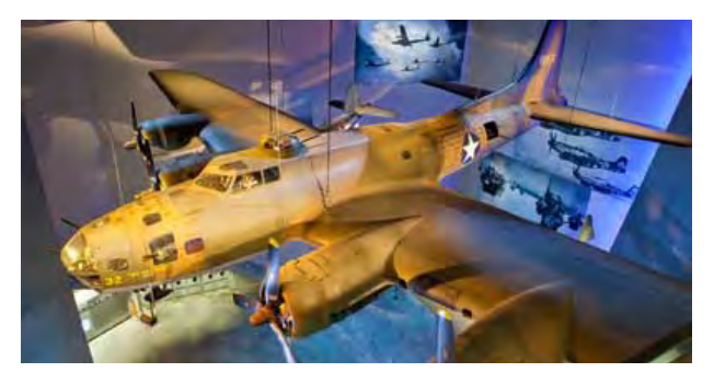
The World War II Museum