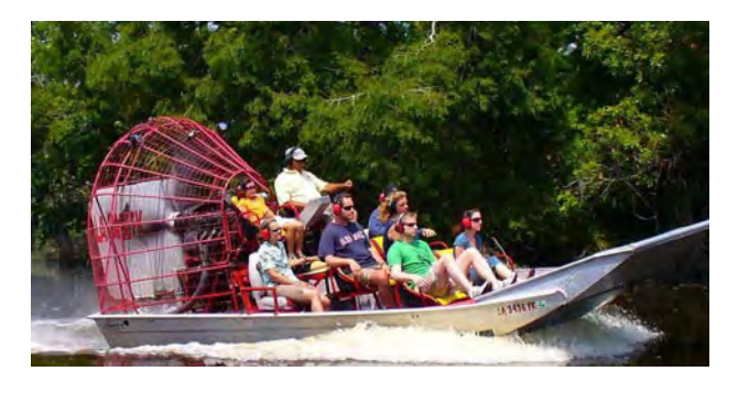
The Swamp & Wetlands