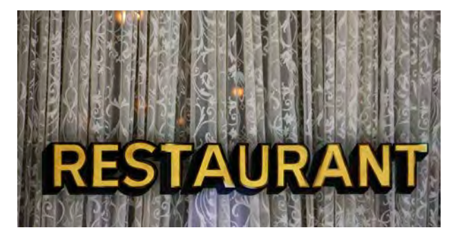
The Best New Orleans Restaurants