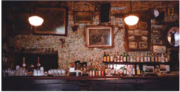
New Orleans Spirits and Spirits