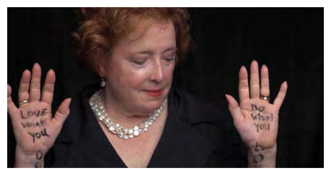
Beyond the Booth Photography