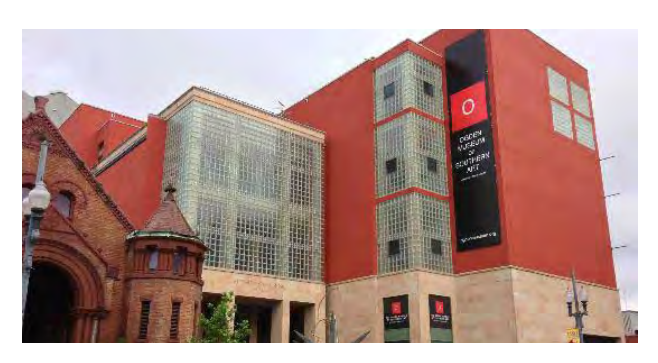
The Ogden Museum of Southern Art