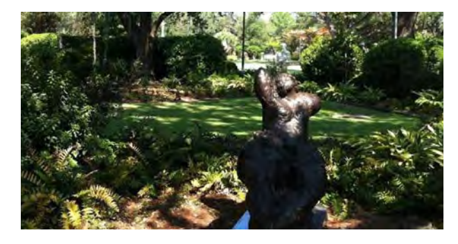
Gardening at NOMA